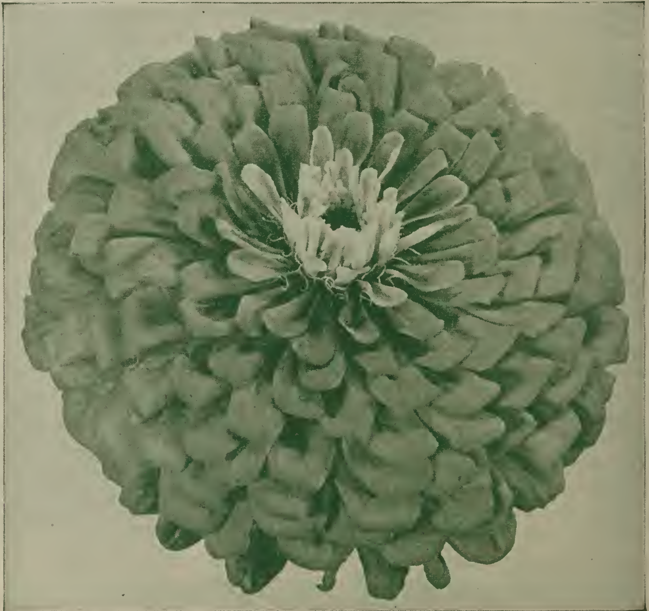
Giant or Mammoth Zinnias